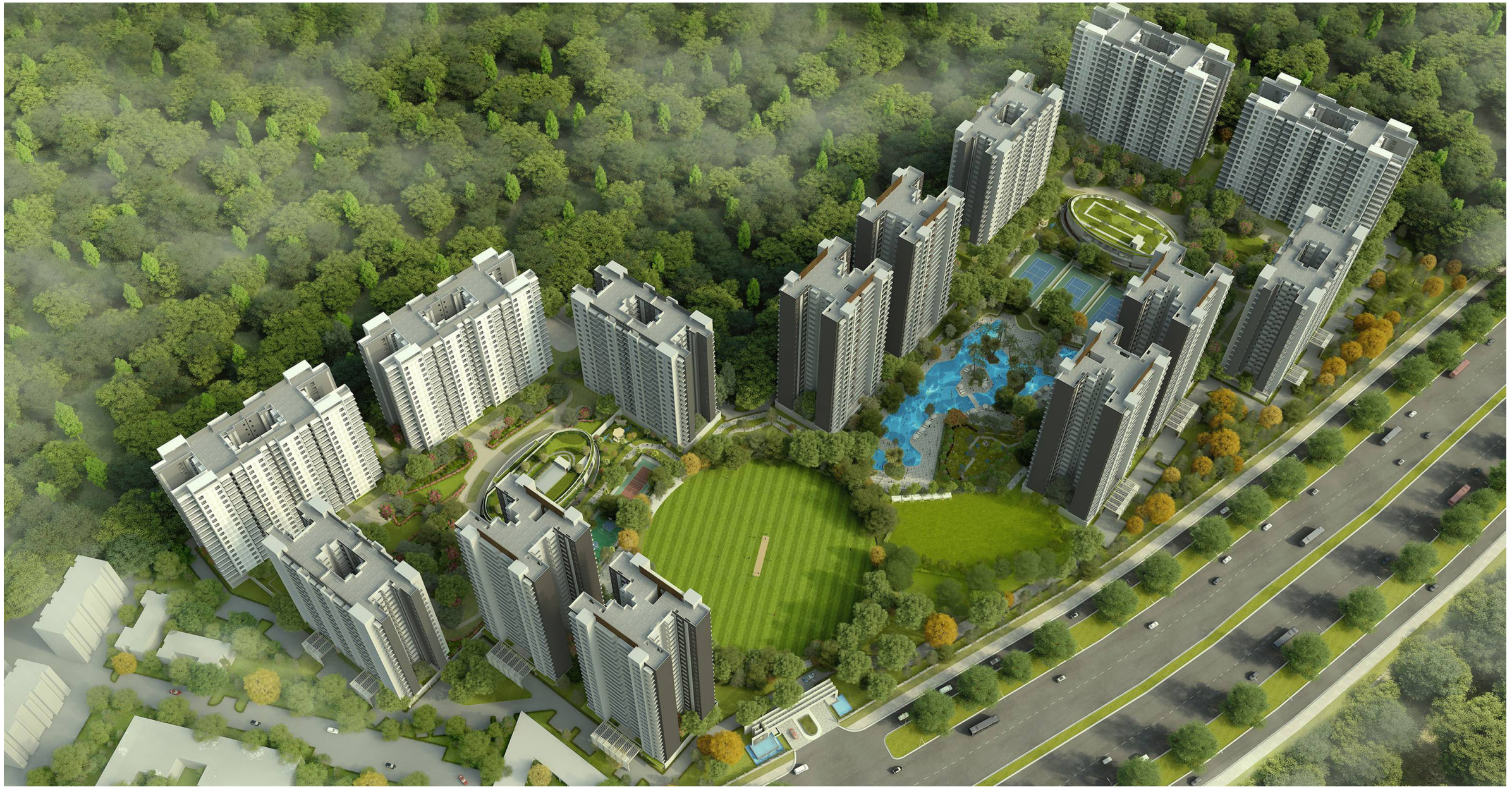
ARTISTIC IMPRESSION. BIRD'S EYE VIEW OF SOBHA CITY.