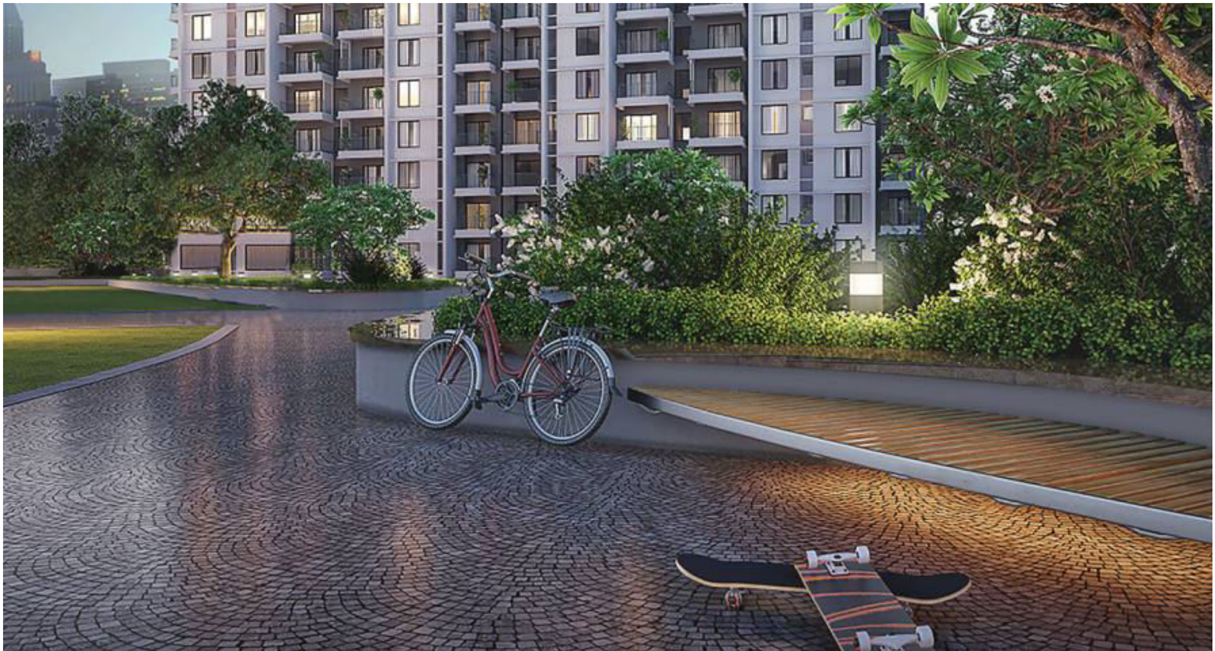
ARTISTIC IMPRESSION. PAVED PATHWAYS AND NATURAL LANDSCAPING.