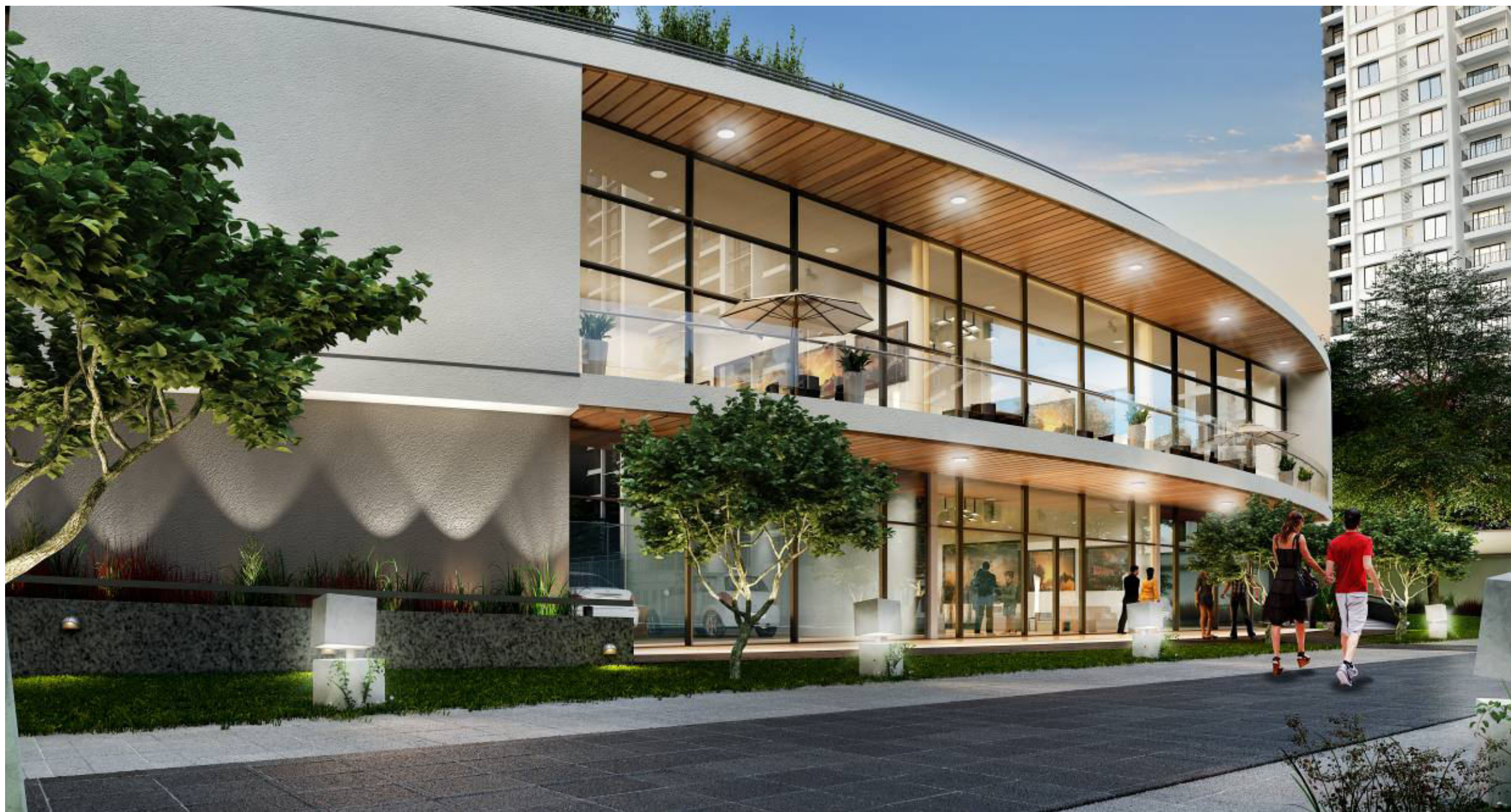
ARTISTIC IMPRESSION. THE CLUB, OVAL 2.