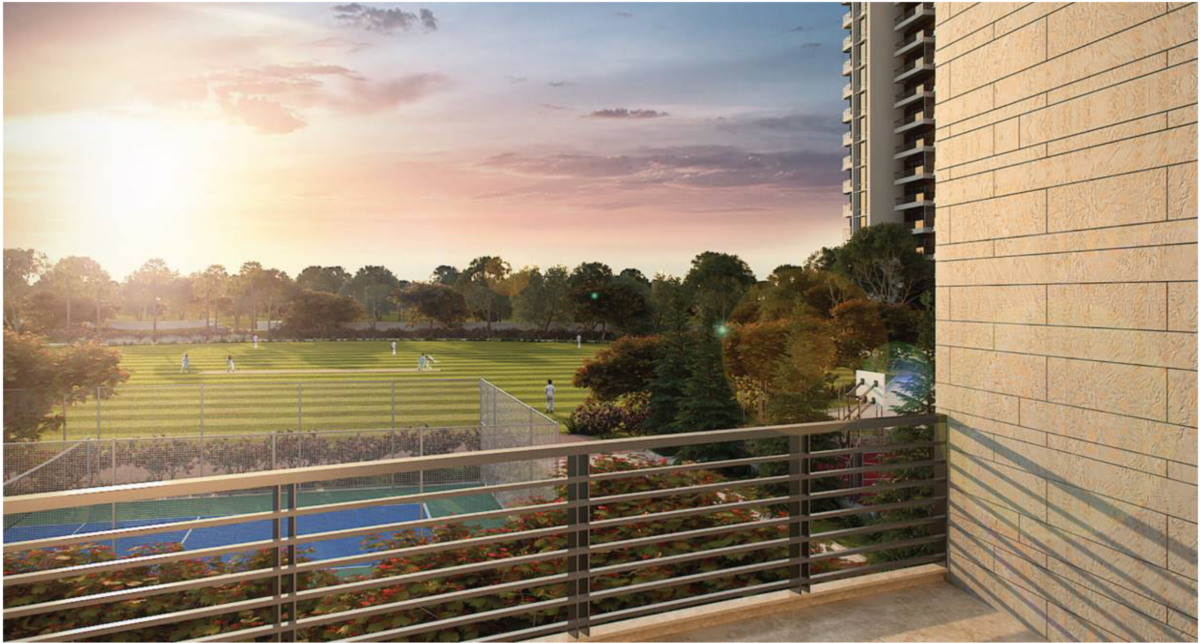
ARTISTIC IMPRESSION. VIEW FROM THE CLUB, OVAL 1.